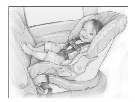
Figure 2. Rear-facing—only car safety seat.