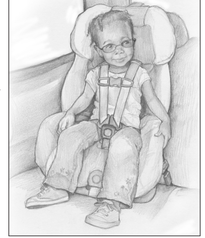
Figure 5. Forward-facing—only car safety seat.