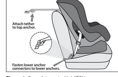
All lower anchors are rated for Figure 1. Car safety seat with LATCH.

ceiling, or floor (in most minivans, SUVs, and hatchbacks). All car safety seats have attachments that fasten to these anchors. Nearly all passenger vehicles and all car safety seats made on or after September 1, 2002, are equipped to use LATCH.