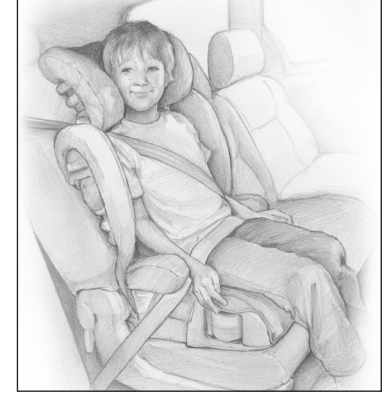
Figure 6. Belt-positioning booster seat.

Two types of booster seats are available: high-back and backless. They do not come with harness straps but are used with lap and shoulder seat belts in your vehicle, the same way an adult rides. They are designed to raise a child up so