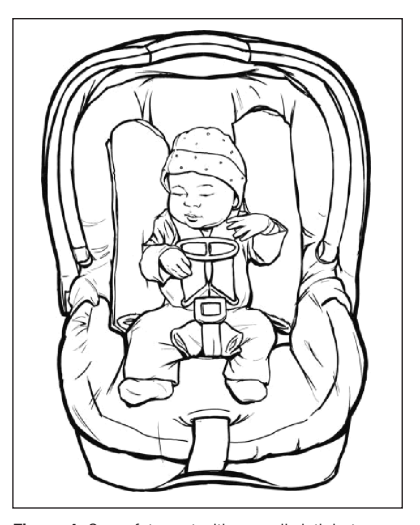
Figure 4. Car safety seat with a small cloth between the crotch strap and infant; retainer clip positioned at the center of the chest, level to the infant's armpits; and blanket rolls on both sides of the infant.

A: A car safety seat should be approved for a baby's weight. Very small babies who can