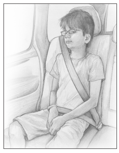
Figure 7. Lap and shoulder seat belt.

with the seat or are specifically approved by the seat manufacturer. These products are not covered by any federal safety standards, and the AAP does not recommend they be used. As long as children are riding in the correct restraint for their size, they should not need to use additional devices.